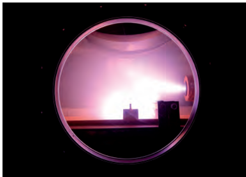
arcPECVD process operating in the labFlex® 200

Dual magnetron plasma source used for the magPECVD process